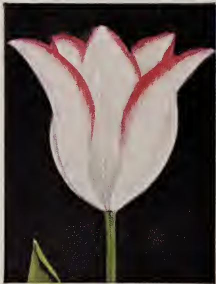
COTTAGE TULIP PICOTEE